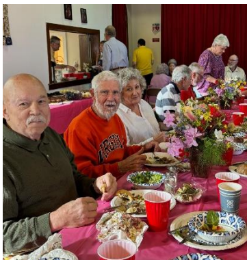
Everyone seems to be enjoying good food and a neighborly chat in pleasant surroundings!

Also, if your contribution is by check, please make it payable to Grace Episcopal Church and note FMS on the memo line.